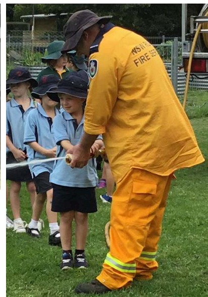
Students engaged and having fun at the Stay Safe Day

A friendly reminder that our P & C Meeting is on tonight at 6.00 pm in the schools staff room. We would love to see some new faces.