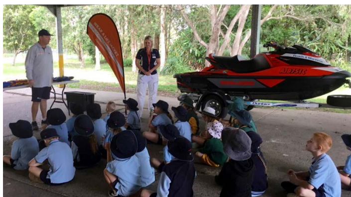
The RMS with their jetski on display