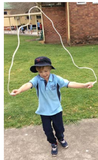
L:R – Tahlia & Lachlan skipping up a storm