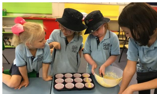
Peer club cooking group

We will start a collection tub at the school which students can put them in each morning.