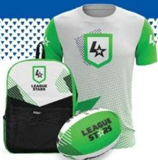
Pack items may differ from ones shown

Garry Stevenson gstevenson@nrl.com.au 0429 834 204