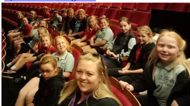
Our students had the privilege to attend at the ballet at the Glasshouse last Friday and from all reports it was amazing!

https://www.glasshouse.org.au/Whats-On/Community-Open-House-24-Aug-2019