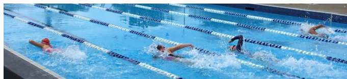
Smithtown student battling it out in the pool Check out our Facebook page for further photos!