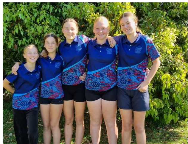
Smithtown Public School's Debating Team

Congratulations to our Debating Team who were victorious in their debate against Aldavilla Primary School last Wednesday. They continue their successful run in the Premier's Debating Challenge and are on their way to the next knock out round. So proud of your efforts Team!