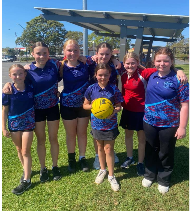
Smithtown Public School's Netball Team